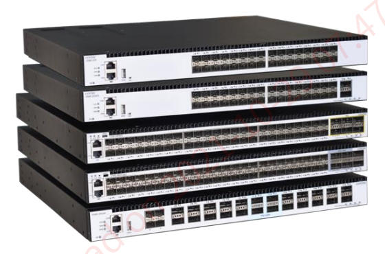
Figure 1 Centec E580 Series

The E580 Series Switches (Figure 1) currently includes five configurations: E580-20Q4Z/E580-48X2Q4Z/ E580-48X6Q/E580-32X2Q/E580-32X.