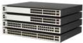
Figure 1 Centec V530 Series TAP Switch

The V530-TAP Series Switches currently include these configurations: V530-24X2C /V530-24X2Q/V530-24T8X/V530-48T4X/V530-48S4X.