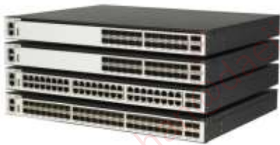
Figure 1 Centec V530 Series

The V530 Series Switches currently includes following configurations: V530-24X2C/V530-24X2Q/V530-24T8X/V530-48T4X/V530-48S4X/V530-48P4XJ/V530-24P4XJ.