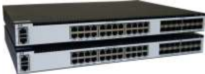
Figure 1 Centec V550 Series TAP Switch

The Centec Series TAP (Test Access Port) is high performance Pizza box switches to meet next generation network visibility requirements, for delivering network traffic data to out-of-band and inline network and security analysis tools. V550 TAP switch is designed based on Centec's fifth generation chipset CTC7148 and software platform CNOS, which supports various of TAP functions, including M: N aggregation and replication, load balancing, tunnel de-encapsulation, traffic filtering and packets editing. In additional, the system offers wide set of capabilities for management needs, as WEB GUI, Open API, SNMP etc. The V550-TAP Series Switches currently include these configurations: V550-24T16Y/V550-24T16X.