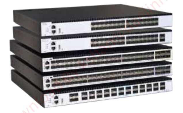
Figure 1 Centec V580 Series

The V580 Series Switches currently includes five configurations: V580-20Q4Z/ V580-48X2Q4Z/ V580-48X6Q/ V580-32X2Q/ V580-32X