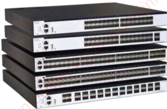
Figure 1 Centec V580 Series

The V580 Series Switches currently includes five configurations: V580-20Q4Z/ V580-48X2Q4Z/ V580-48X6Q/ V580-32X2Q/ V580-32X